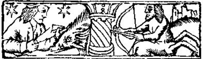
Medieval Woodcuts Clipart Collection

Lauris and Ætta Prince and Princess, Summits